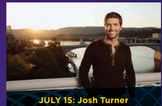
JULY 15: Josh Turner

FREE CONCERTS Nightly house band plus big acts each Saturday.