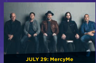
JULY 29: MercyMe