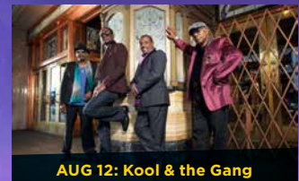
AUG 12: Kool & the Gang